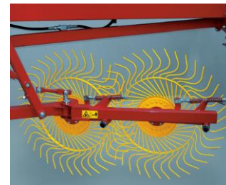
Single side opening kit