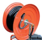
Manual EV hose reel 25 or 50 m Plate PVC hose Spraying