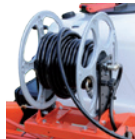
Manual EV hose reel 25, 50 or 100 m Aluminium PVC or rubber hose Spraying or watering or HP