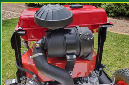
CHOICE OF QUALITY HONDA & KAWASAKI ENGINES

TOW 'N' MOW Slashers are manufactured from quality materials, powdercoated and zinc plated for long lasting performance in the harshest of environments.