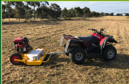
SLASH PADDOCK GRASS