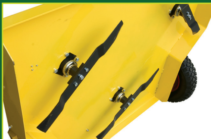
TRIPLE BLADE CUTTING SYSTEM