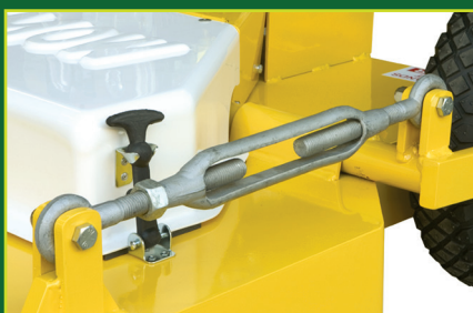
QUICK ADJUSTABLE HEIGHT CONTROL TURNBUCKLE