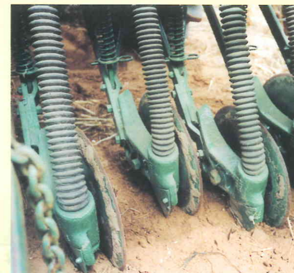
A seed hose adjacent to the disc, delivers seed and/or fertilizer into the bed at a predetermined depth.

The single disc assembly, is less prone to block-up in damp sticky conditions and will not catch on prunings and roots.