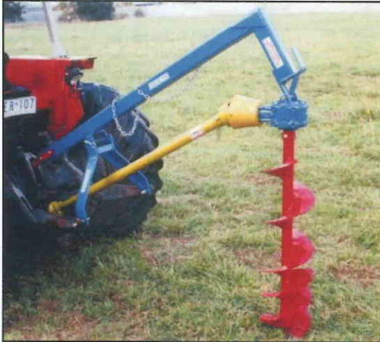
Standard Model with 12" Auger