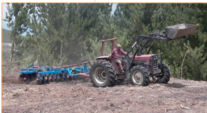
Picture (above) - 28 plate RM80 working up a harvested pine plantation in North Island, New Zealand.