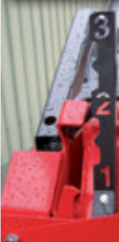
Regulating tine p