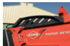
Side projection guards

"In European Union countries, our machines comply with the "Machinery" directive; in other countries, they comply with local safety legislation. In our brochures, protective devices may have been removed for the purposes of illustrating certain details. In all cases, these devices must remain in place in accordance with the instruction manual. We reserve the right to make alterations to our models or their equipment and accessories without notice. Machines and equipment in this leaflet can be covered by at least one patent and/or registered design. Registered trademark(s)."