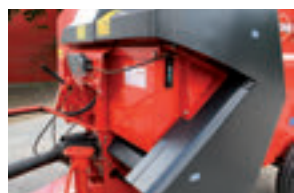
45 L/min -1 (12 gpm) hydraulic power unit