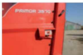
Dual tailgate control

Optional equipment varies from country to country ■ Standard equipment - Unavailable