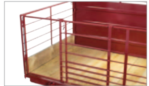
Stock crate with easy slide gate and removable sides.