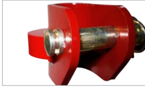
Double clevis for lower link arms, strong and reliable, no threaded pins to come loose