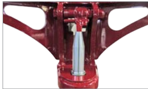
Interchangeable Category 2 or 3 towing pin with a Wearalloy base plate for the towing eye rest, extending the life of the hitch.