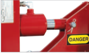
Double acting 90mm hydraulic ram.