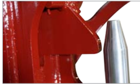
Locking latch, designed strong to lock the towing eye securely in place