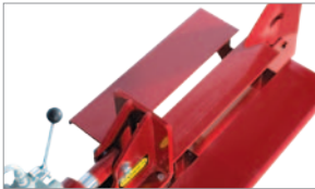
Wide work bench area, to cope with the big logs.