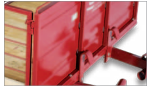
Full steel front - swaged galvanised sheet steel at front keeps tray clean.